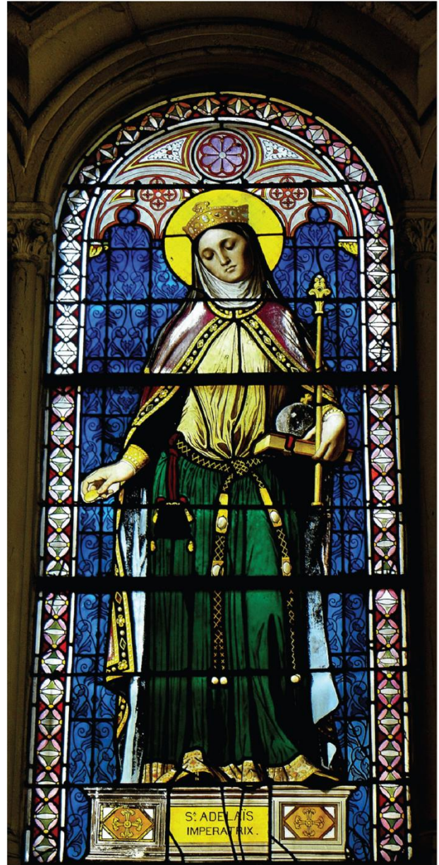
Left: Kehinde Wiley (b.1977), Saint Adelaide , 2014, stained glass, 251 x 116 cm. © The Stained Glass Museum (ELYGM:2021.1).